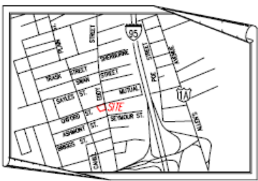
LOCUS PLAN (NOT TO SCALE)